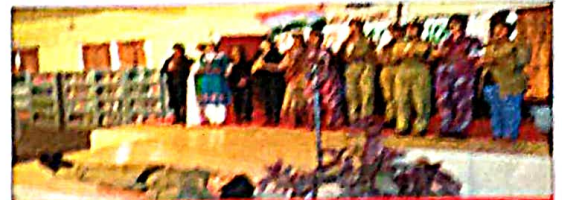
Strength of Nation derives from the Integrity of Home