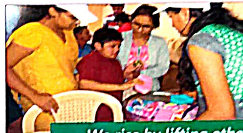
We rise by lifting others