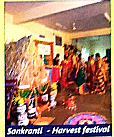
Sankranti - Harvest festival