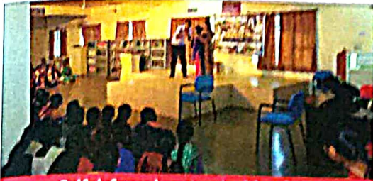
Self defense is nature's eldest law